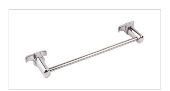
Optional Towel Bar